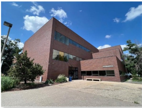
Central Classroom Building